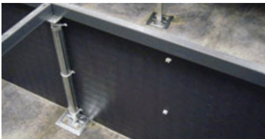
Underfloor Plenum Panels