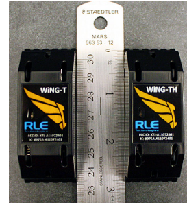
WiNG-T & WiNG-TH